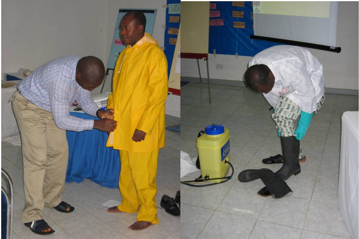
Training sessions also dealt with what to wear and how to wear Personal Protective Equipment (PPE)