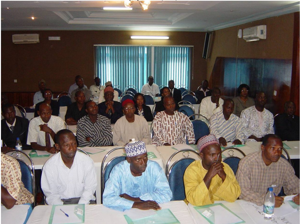
The participants included representatives from Dealer and Farmer organisations as well as Journalists from the local press.