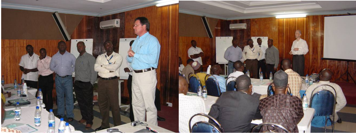
On both days of the two-day cascade training programme, there were general discussions and lively debates, facilitated by Master Trainers and Facilitators.