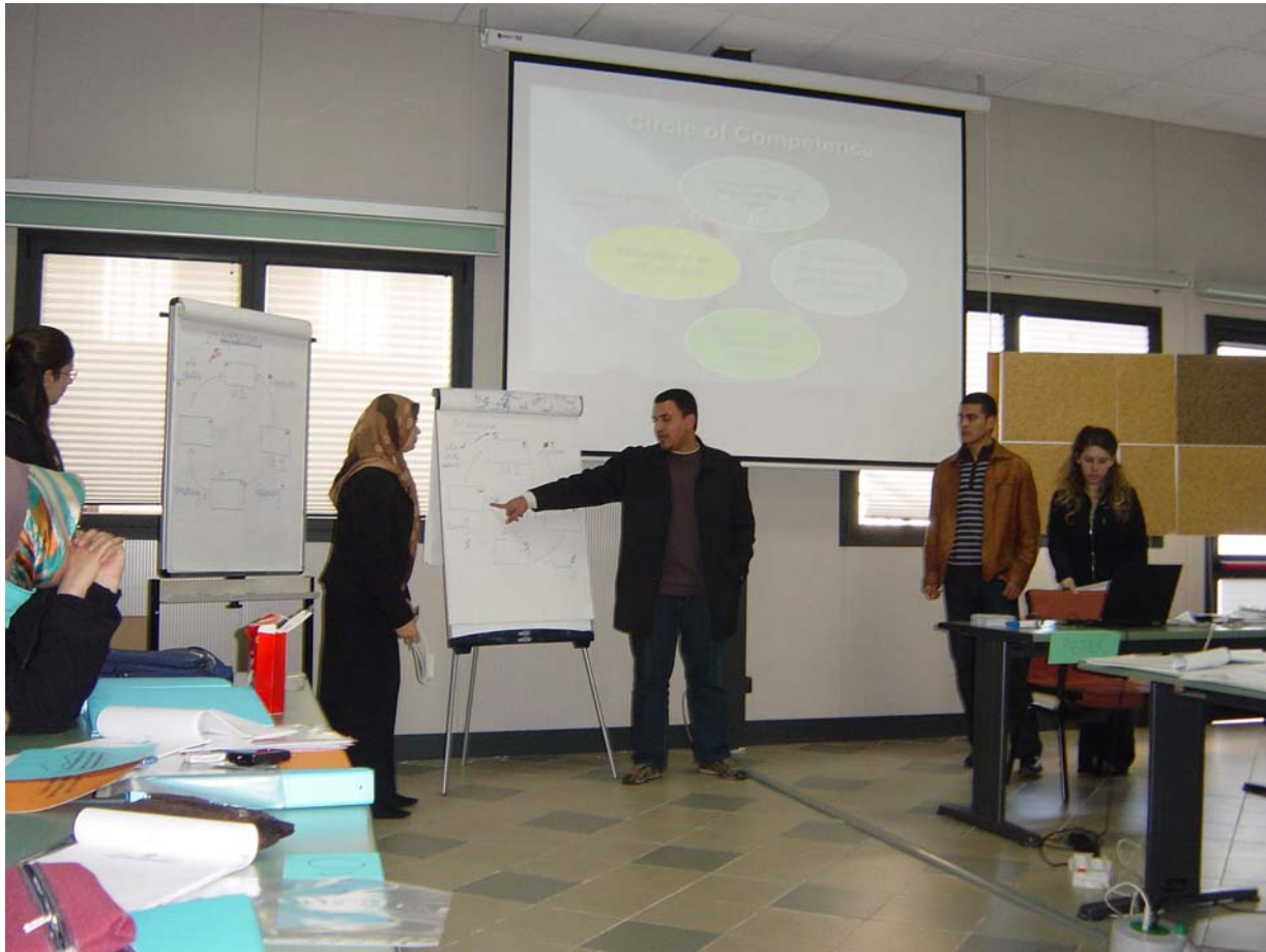
A very well organised group exercise delivered on the Circle of Competence.