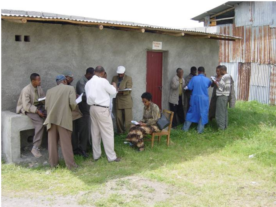
Participants doing practical exercises at the Pesticide Store compound, and learn to audit a store.