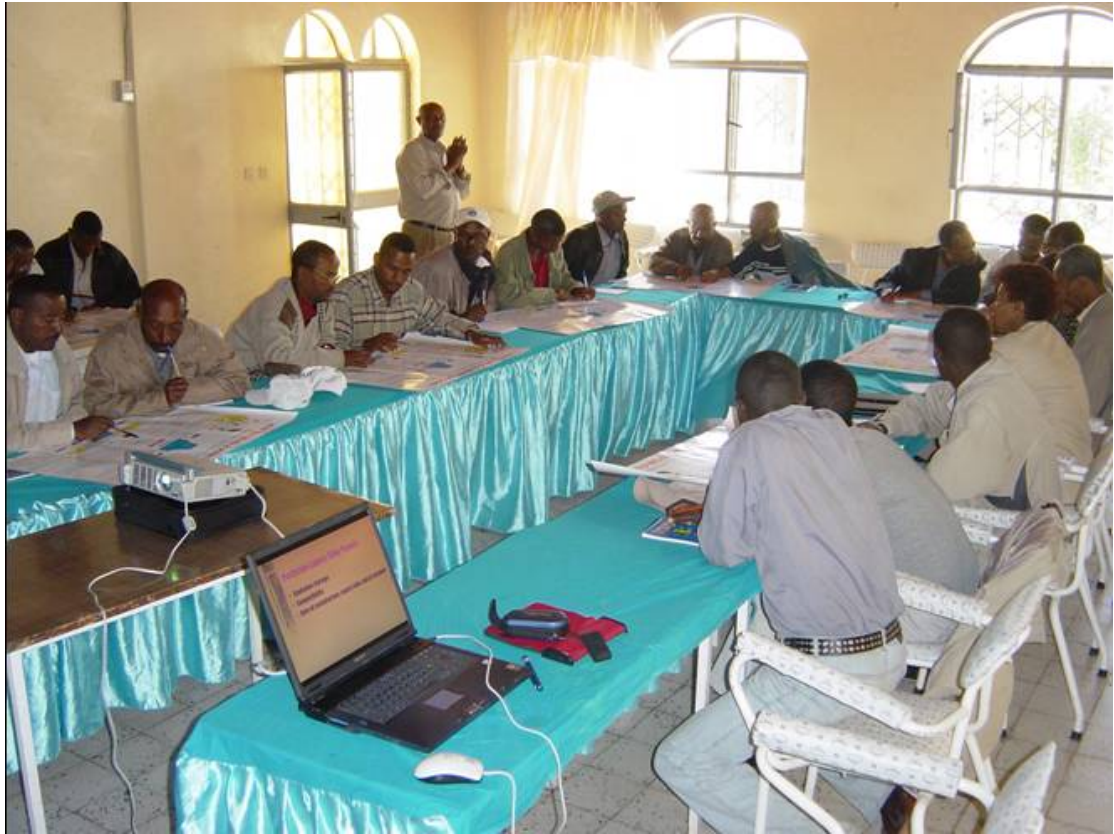
Participants doing classroom exercises and learn how to read a label properly.