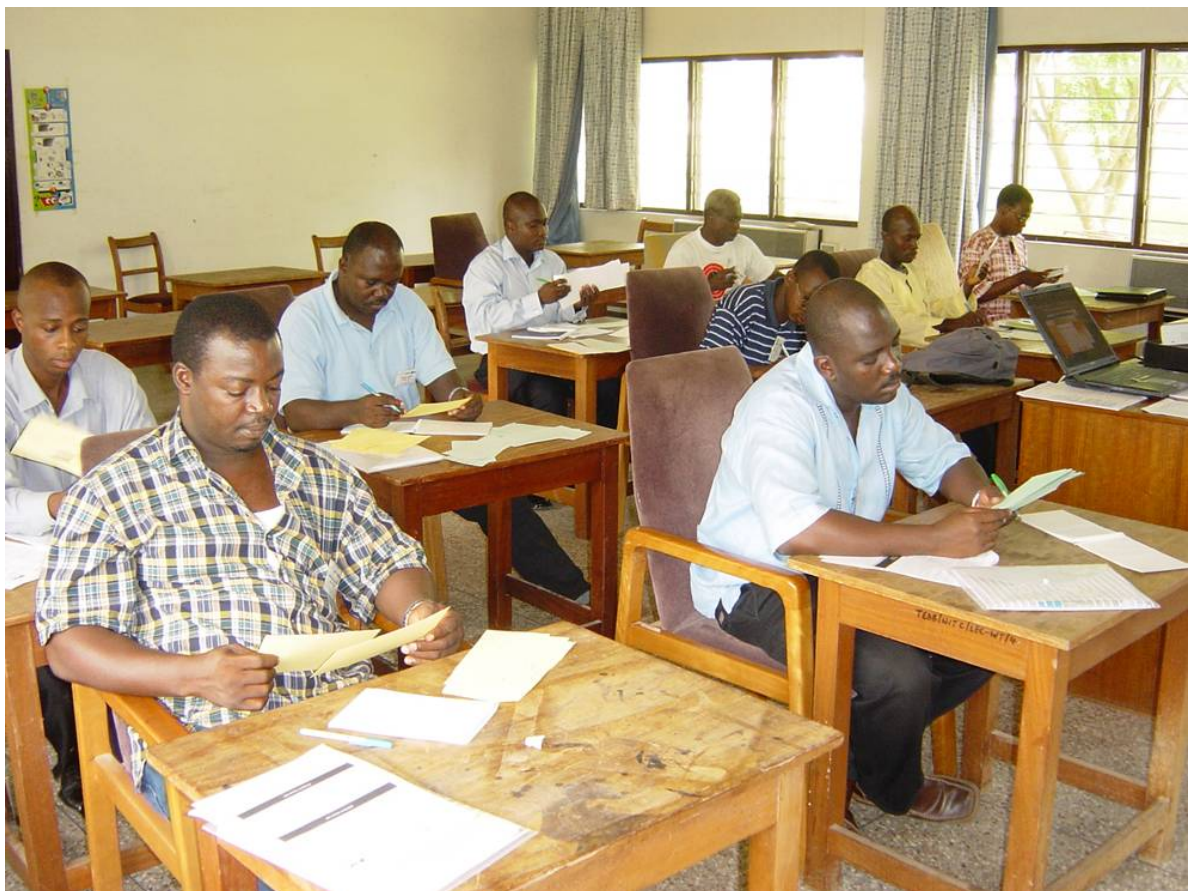
While the Dealers did the record keeping course, the 8 Master Trainers, conducted an assessment of the feedback responses from Dealers.