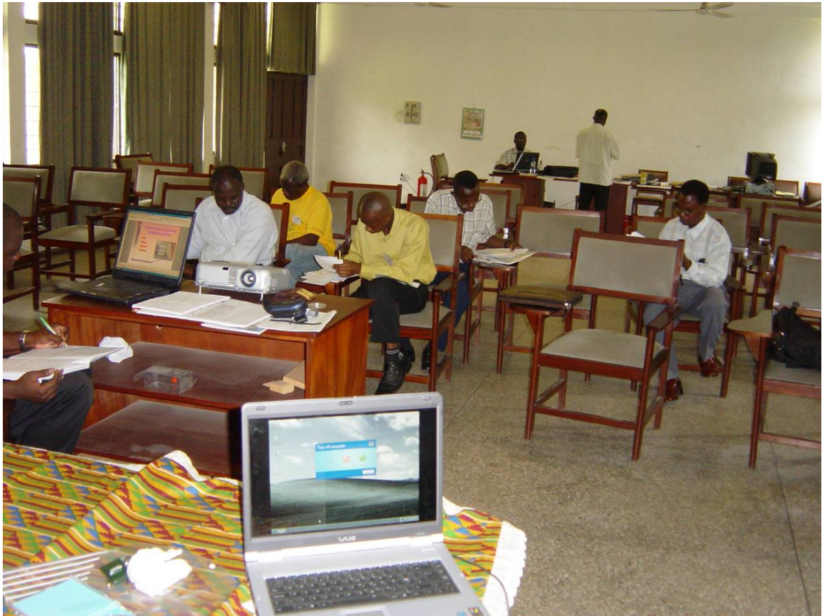
The 8 Master Trainers, seen here preparing their lessons, underwent a one-day Refresher Course, prior to the Responsible Training Course for the GAIDA Dealers.