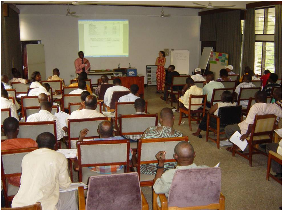
The Dealers were also provided with a one day training course on record keeping.