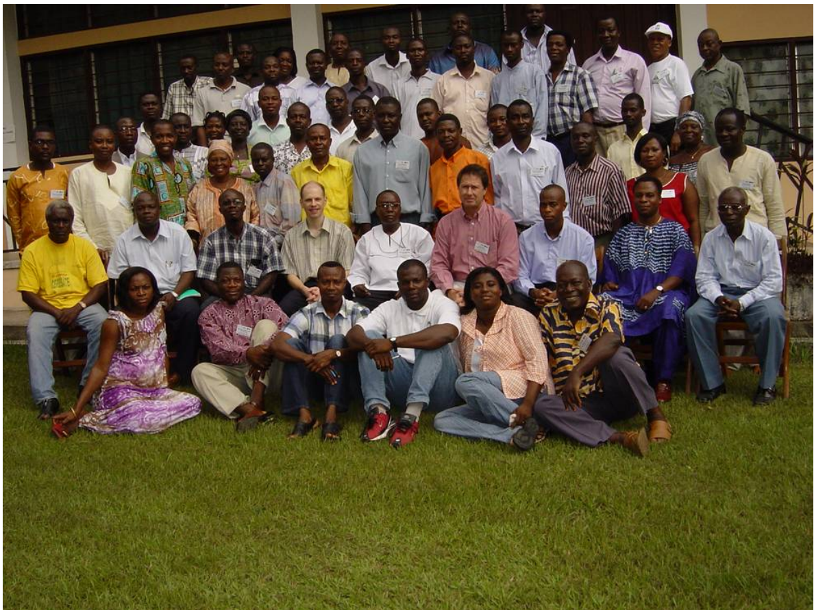
The group of Dealers, Trainers and Organisers of the four Training Workshops, for Master Trainers and Dealers.