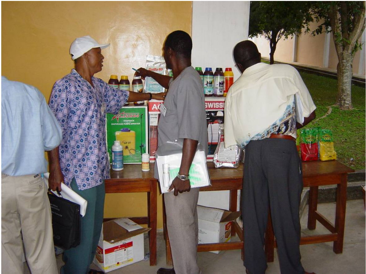
Dealers were also able to view Ghana pesticide company's products during intervals.