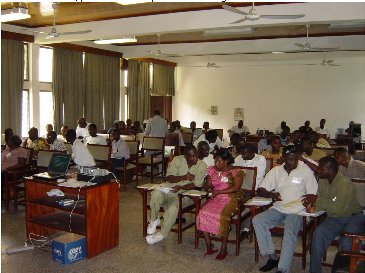
Sixty Dealers from all over Ghana attended a two-day Safe Use Training Course. All 8 Master Trainers presented two subjects each.