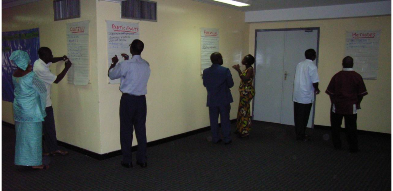
Some participants brainstorming on what makes the quality of a training