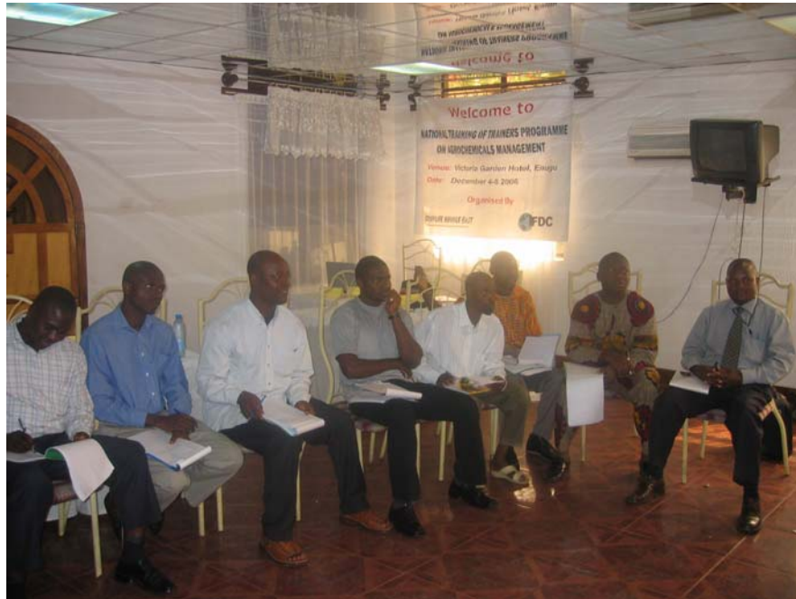
Participants listening to the session on training aids