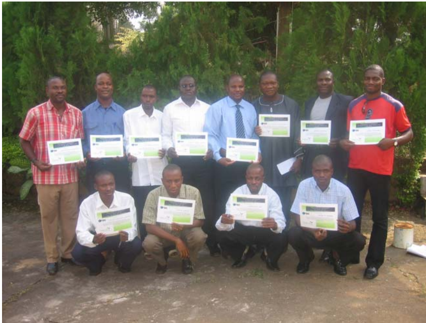
Participants handing their certificates

This very participative training was a success: twelve participants received Certificates of Competence, based on passing a written test and a lesson assessment. Each participant was also presented with hard and electronic copies of all available Safe Use training materials, for use in future cascade training.