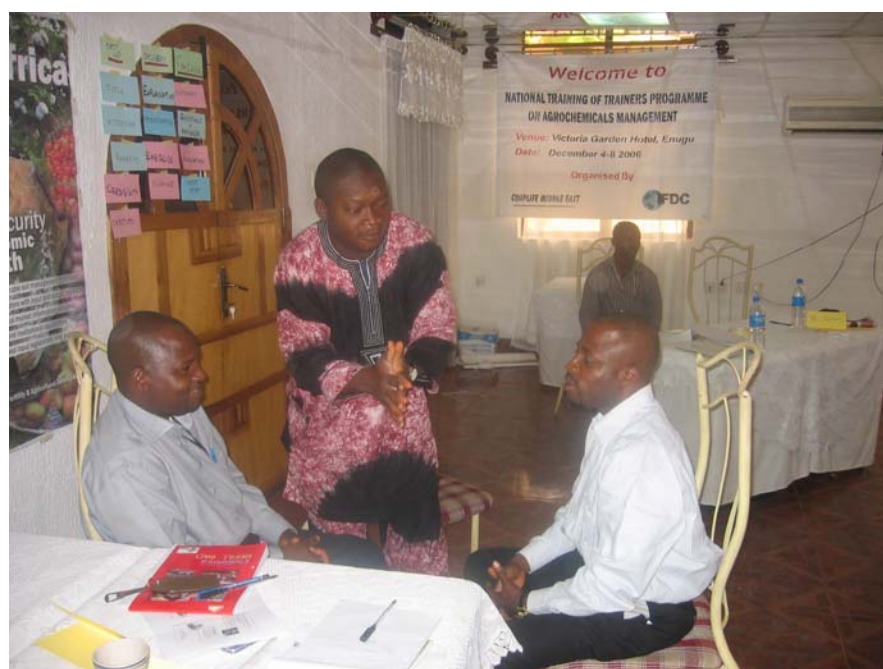
Participants in a role play on group dynamics