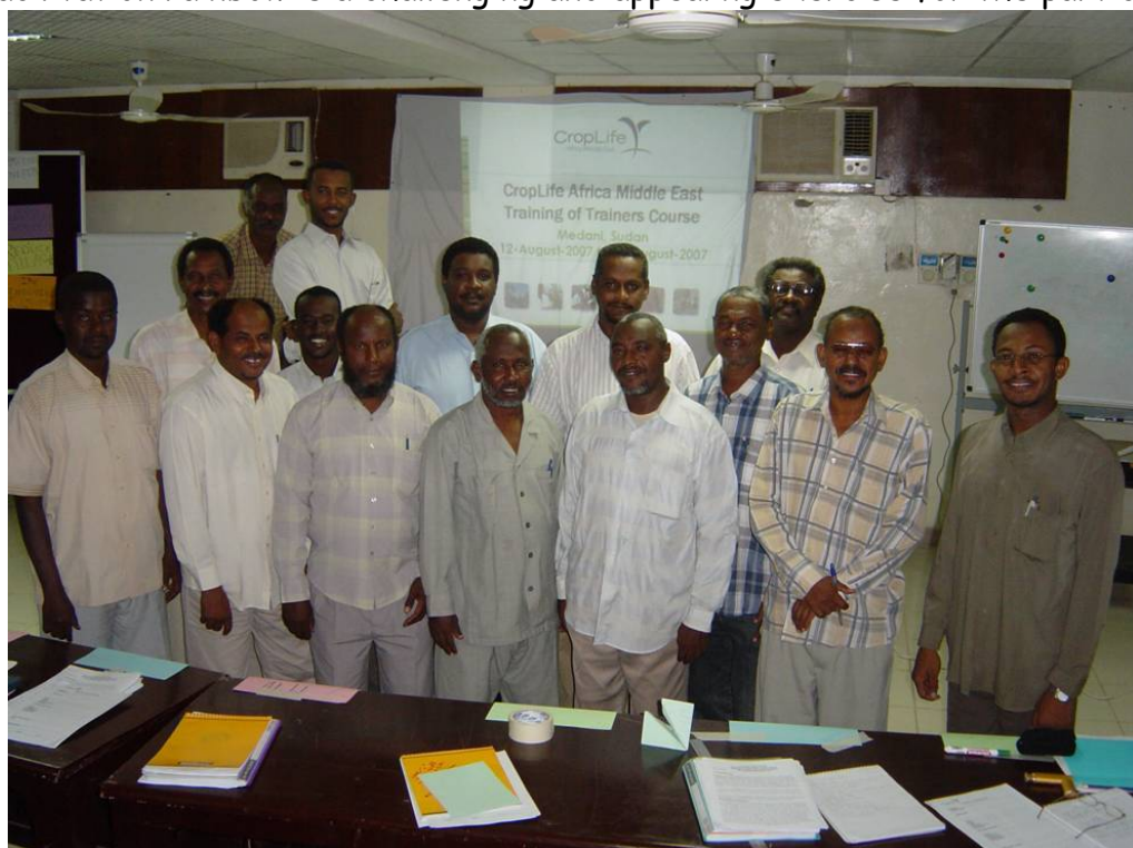
The group of participants pose in the training room at the end of the course.