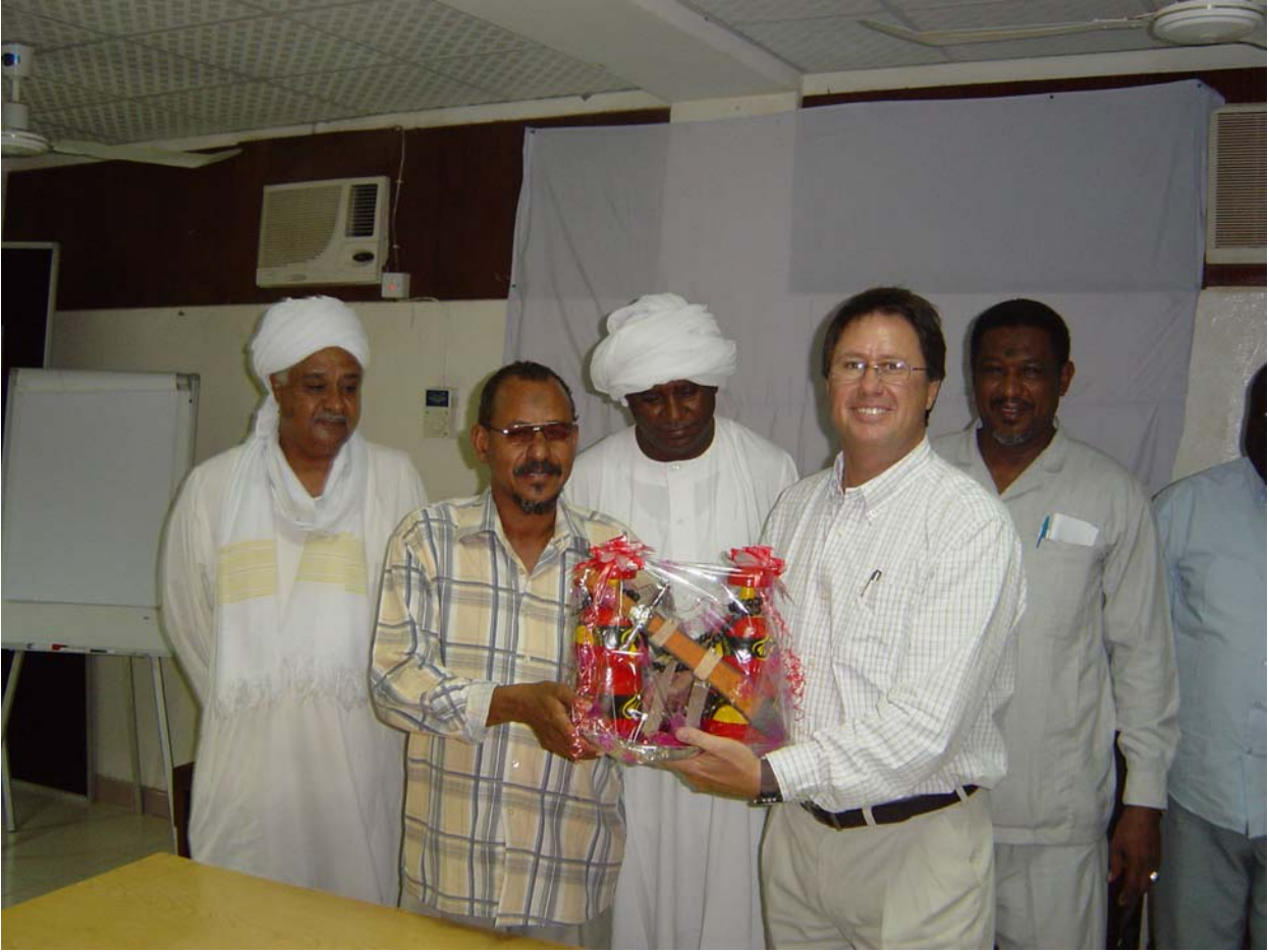
Unusual and interesting gifts for the facilitator are always gladly received.