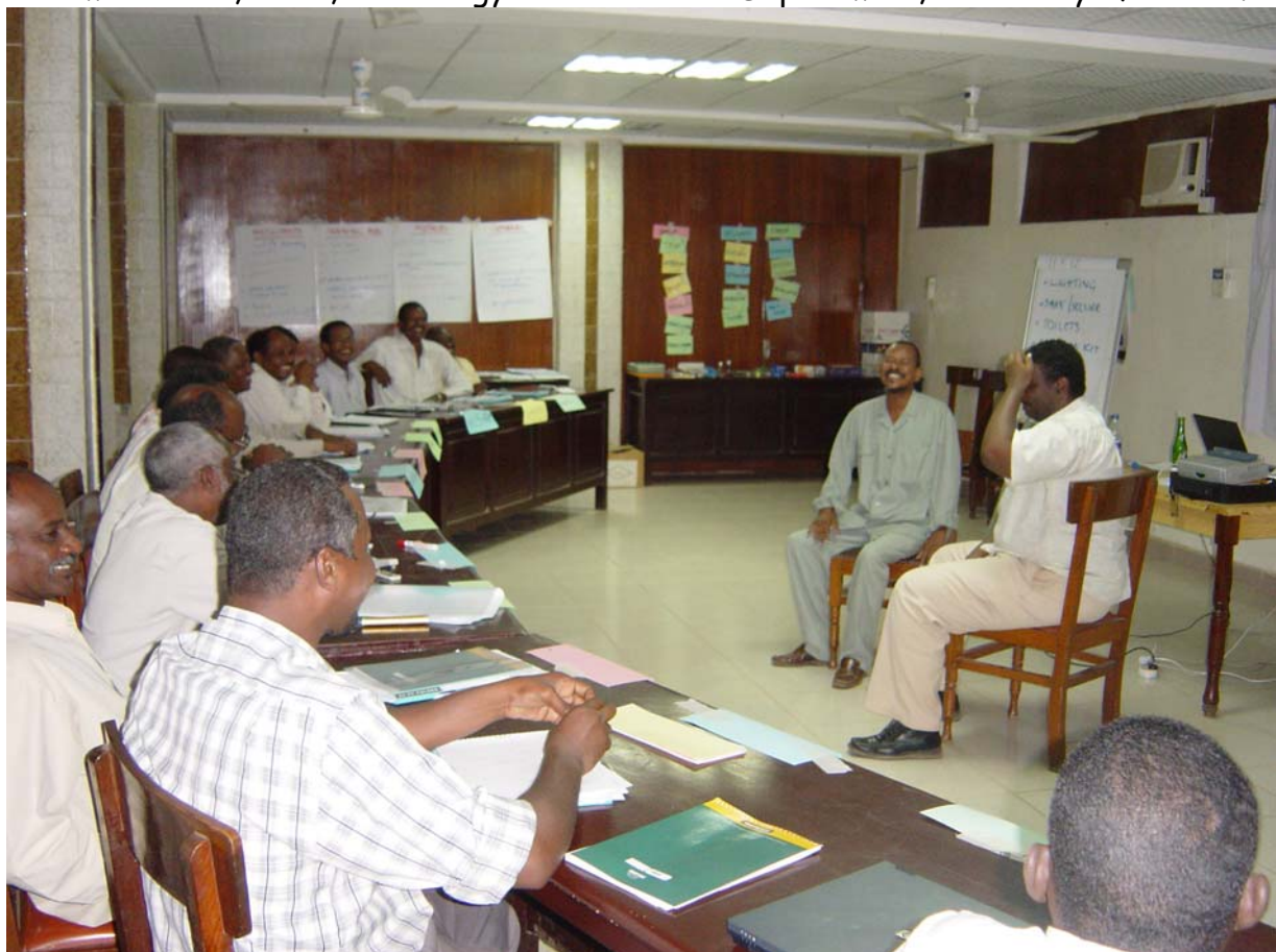
The questioning exercise always yields bags of laughter.