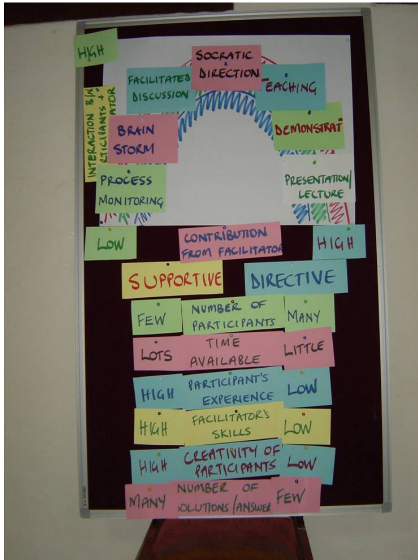
The facilitation rainbow is a challenging and appealing exercise for the participants.