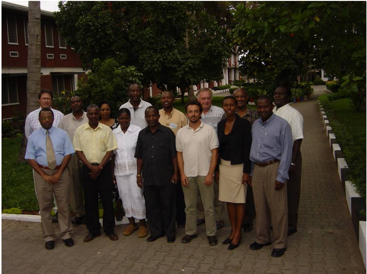
Fourteen participants from Tanzania, Kenya, Somalia and Ethiopia attended the Master Trainer Training course in Dar-es-Salaam.