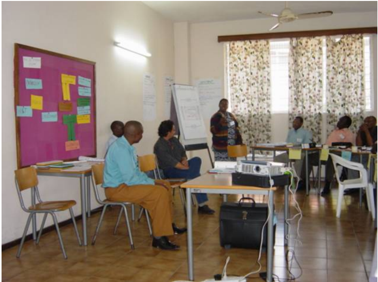
Learners do several participative exercises, one being a group presentation, for which there is a prize and subsequently, great competition.