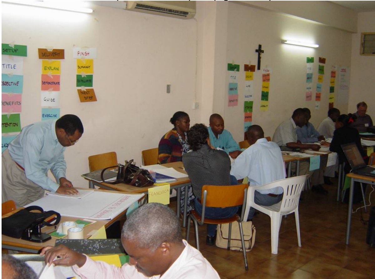
Learners prepare for their group presentations.