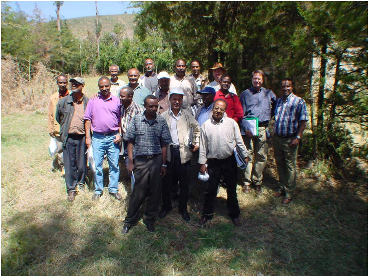
3: Group of trainees and trainers at the store site