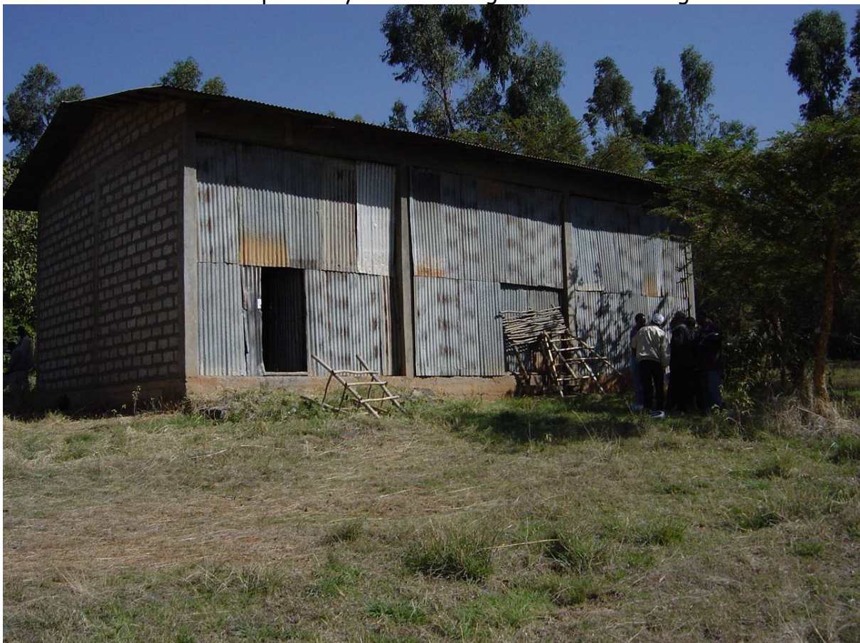
2: Participants conduct risk assessemnt & PPE selection before entering the store