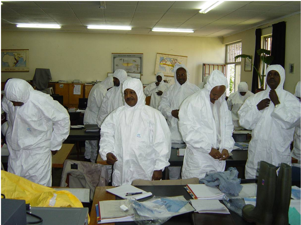
1: Participants try on PPE during classroom training